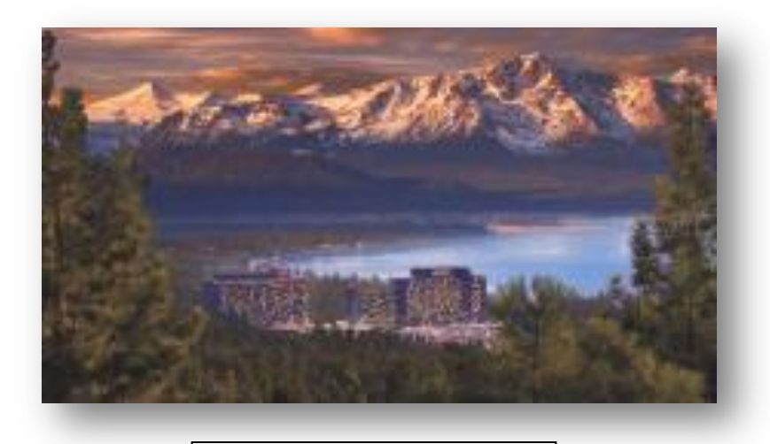
Harvey's Resort and Casino

The Congress : Presenters from around the world were required to submit proposals and papers in advance, with a standard 20 minute presentation period followed by 10 minutes of questions. The theme of this year's congress was Multi-Casualty Incidents (MCI). This theme was reflected in the avalanche rescue and medical care themes of the Practical Day workshop on 5 October. In addition, was the fact that many incidents involving multiple casualties occur each year throughout the world.