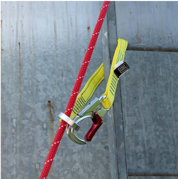
Wrap the lanyard around the structure and connect the carabiner into the ring.

As the leader ascends the tower, an Azzard is wrapped around the main member at the corner just above the metal lacing. Always connect the carabiner into the ring as shown, not around the web. Allow for placement of Azzards at maximum one-meter intervals up the structure. Because the fall factor is greater when the leader is close to the ground the third Azzard is placed \frac{1}{2} meter above the second, and the fourth is placed \frac{1}{2} meter above the third. This also helps to prevent the leader from hitting the ground if he falls near the start of the climb.